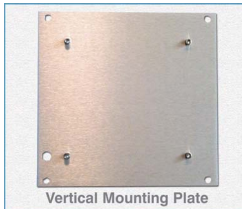
Vertical Mounting Plate