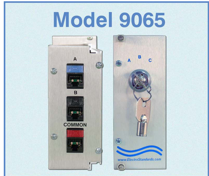
Also available as standalone desktop version.