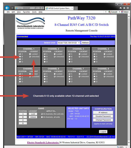
Figure 1: Change the position and lockout from the GUI

Channels 9-12 only when Model 7321 12-channel unit is selected from the Model 7320 8-Channel GUI.