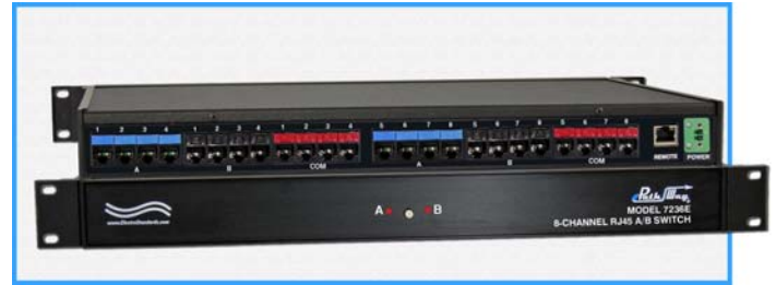
Model 7236E with Ethernet Remote