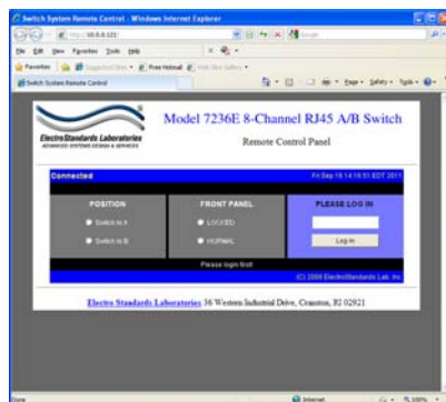
Figure 3: Logging into the GUI

The default password "111111". Password should be changed to something more secure when the user first connects to the unit.