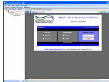
Figure 1: GUI in DeviceInstaller