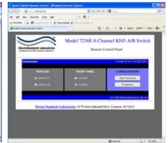
Figure 2: GUI in a Standard Web Browser