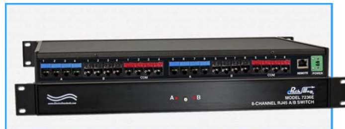
Model 7236E 8-Channel RJ-45 A/B Switch

MODEL 7236E WEIGHT: Approximately 5.5 lbs. (2.5 Kg)