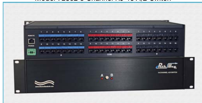
Model 7238E 16-Channel RJ-45 A/B Switch