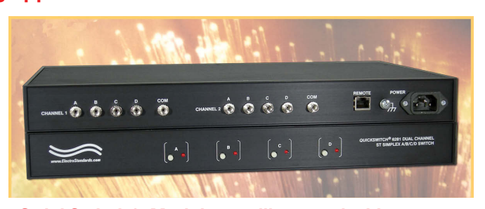
QuickSwitch® Model 6281 illustrated without ears.