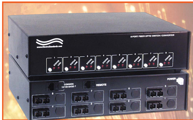
COTS or Customized Switches Available (Call 401-943-1164)

★ Municipalities, schools, government: This product on GSA Schedule!