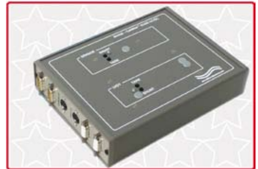
Model 4336 CellMite® Quad AC/DC

The Model 4336 features include nonvolatile memory for parameter and calibration storage, the ability to select between 3 stored LVDT calibrations for the two LVDT channels, and the ability to select between 3 stored force transducers for the two strain gage force channels. Also featured are multi-point and mV/V calibration, remote sense excitation, 24-bit internal resolution with 16-bit analog output, and RS232 serial data output that is compatible with off-the-shelf serial to USB converter cables.