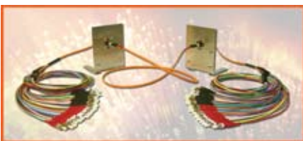
End to end view of 24-fiber MTP Commercial Conversion Kit.