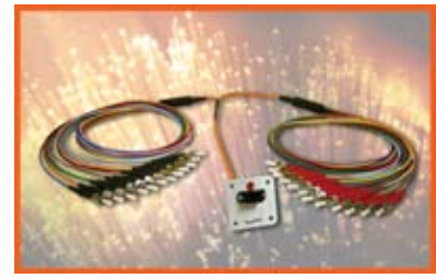
24 Fiber MTP to ST Fan Out with MTP Conversion Fixture.