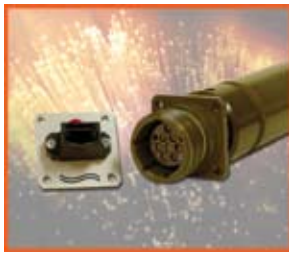
Picture of MTP Conversion Fixture and 8-Fiber M28876