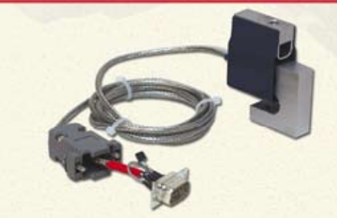
Standard S type load cell shown with a DS2401 electronic tag chip mounted in the hood of the cable.

36 Western Industrial Drive, Cranston, RI 02921 Tel: 401-943-1164 Fax: 401-946-5790